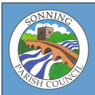
Our New Logo